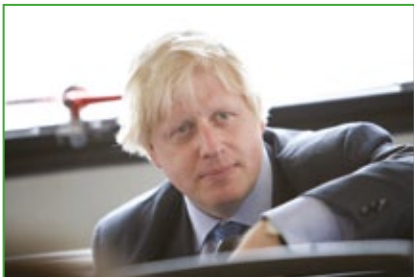
Boris Johnson Mayor of London